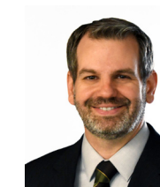
Nikki DeBuse Forest Grove News Times - Hillsboro Tribune